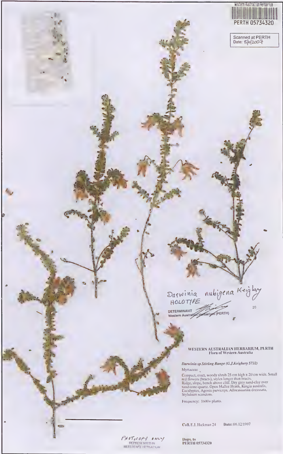
Figure 7. Holotype of Darwinia nubigena , scale = 5 cm.